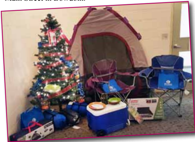
The very popular Lisbon Credit Union tree last year was a camper's dream!

The Bowdoin Community Cares Association (BCCA) is having its 4th annual Community Christmas Festival on Friday, December 2nd from 6pm to 8pm and on Saturday, December 3rd from 10am to 2pm. The Festival will be located once again at the FHC campus located at 1201 Main Street in Bowdoin.